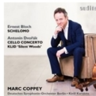
BLOCH Schelomo DVORŽÁK Klid. Cello Concerto