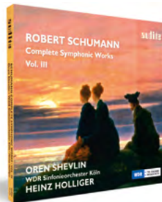
Vol. III audite.de/97679