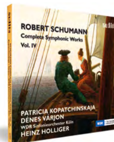
Vol. IV audite.de/97717