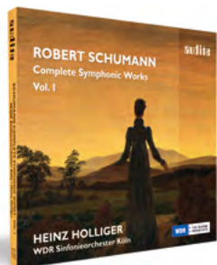
Vol. I audite.de/97677