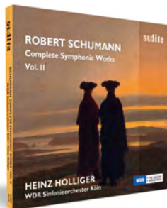
Vol. II audite.de/97678