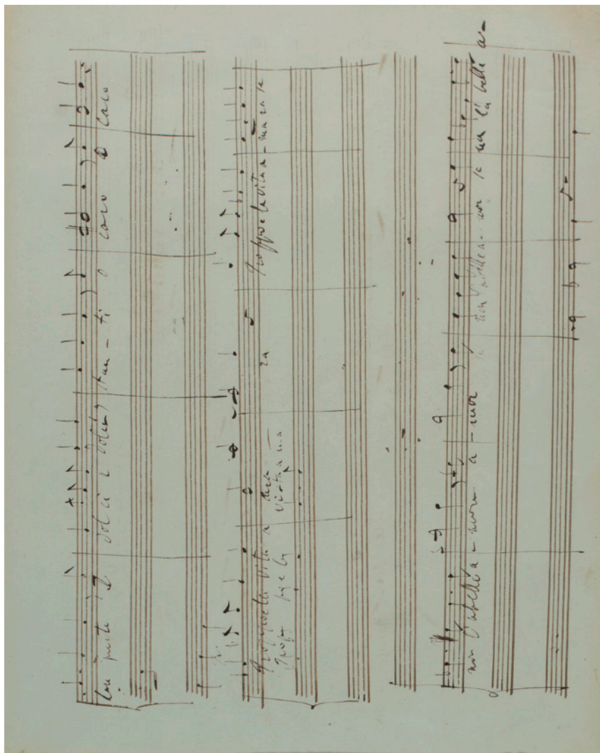
Figure 1. Liszt's autograph MS N4, pp. 70-1, showing the musical 'gaps' in his notation of Sardanapalo (GSA 60/N4) for bars 700-29.