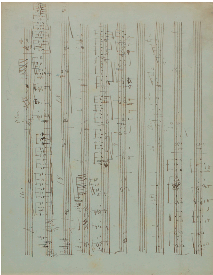
Figure 5b. The first page of Liszt's draft for Sardanapalo , c. 1850, written in a score format similar to that in Figure 5a, and showing similar instrumentation cues. GSA 60/N4, fol. 2; Photo: Klassik Stiftung Weimar.