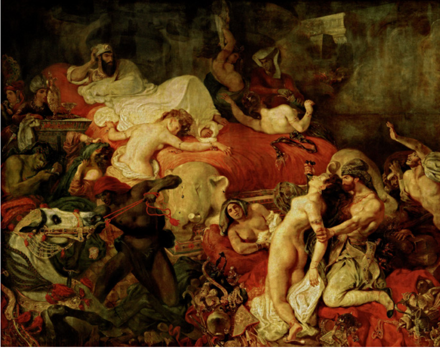
Figure 2. Eugène Delacroix, La mort de Sardanapale (1827–8). Musée du Louvre / Wikimedia Commons.

actions of the Eastern monarch upon learning that his kingdom has been sacked: he witnesses the destruction of all that is dear to him – a bonfire of the vanities – including his concubines, slaves, pets and stud of horses; all in preparation for his famed, opiate-fuelled self-immolation, or, as Byron puts it, ‘a leap through flame into the future’ whose excruciating pain would serve as a historic act of defiance: