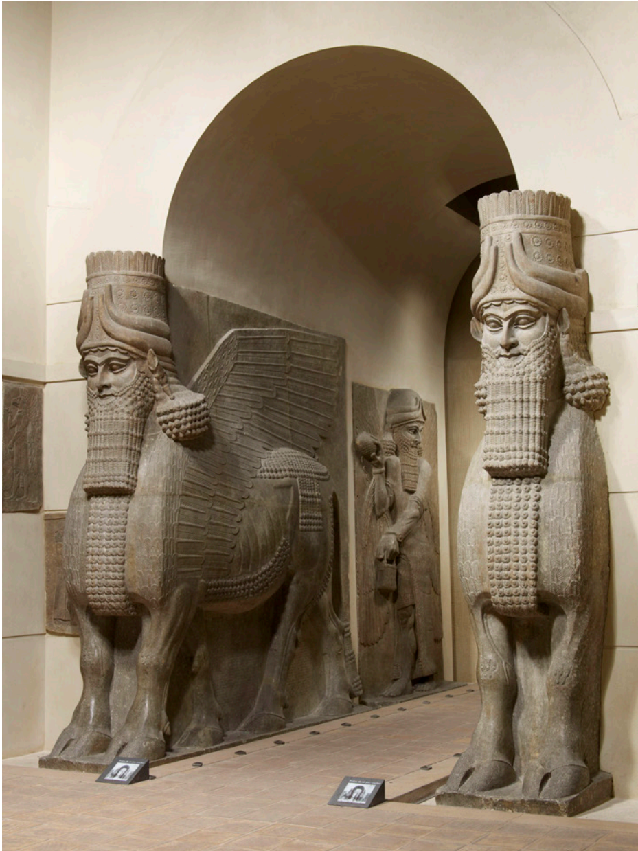
Figure 3. Assyrian shedū or lamassu , winged bulls who guard gateways, relocated from northern Iraq to museums in London and Paris during the 1850s.