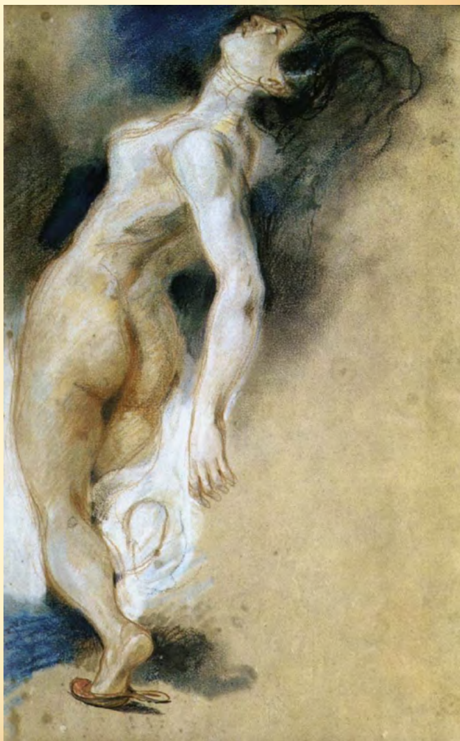
Delacroix, female nude, mortally wounded , 1827 (study for La Mort de Sardanapale ); Louvre, Paris.